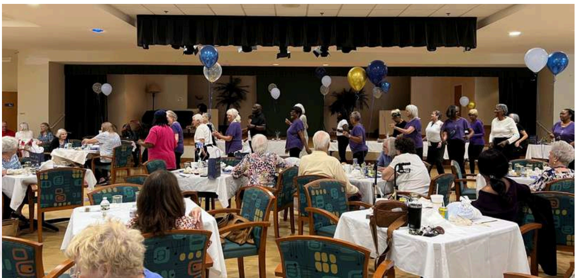
The Benson Beats Line Dance Group performs at the celebration