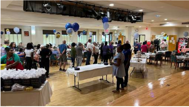
Greatest Milestone Celebration, May 23, 2024